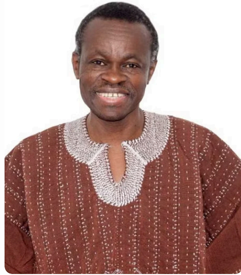
Professor PLO Lumumba